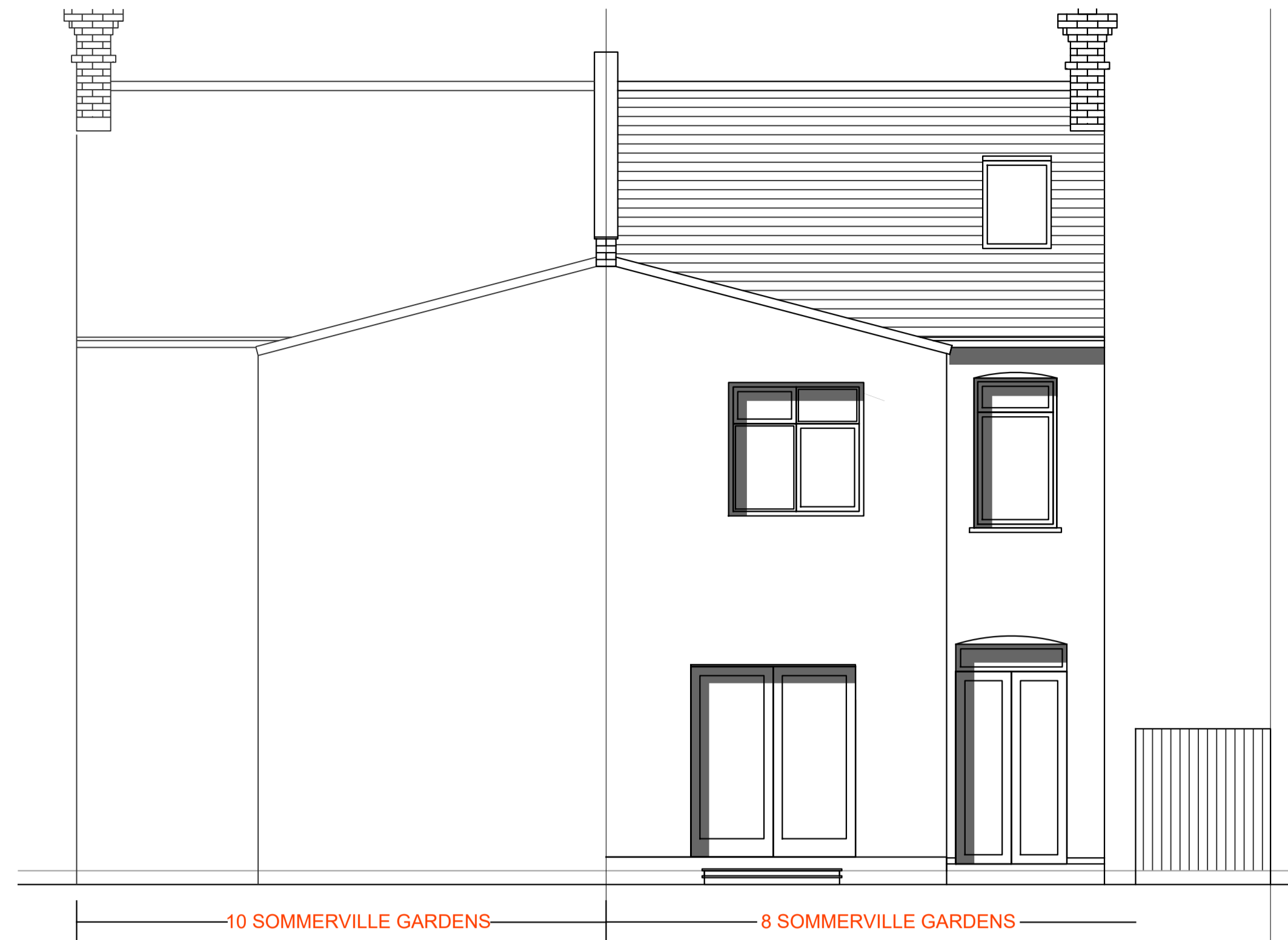
2 EXISTING REAR ELEVATION SCALE: 1:50 @ A1