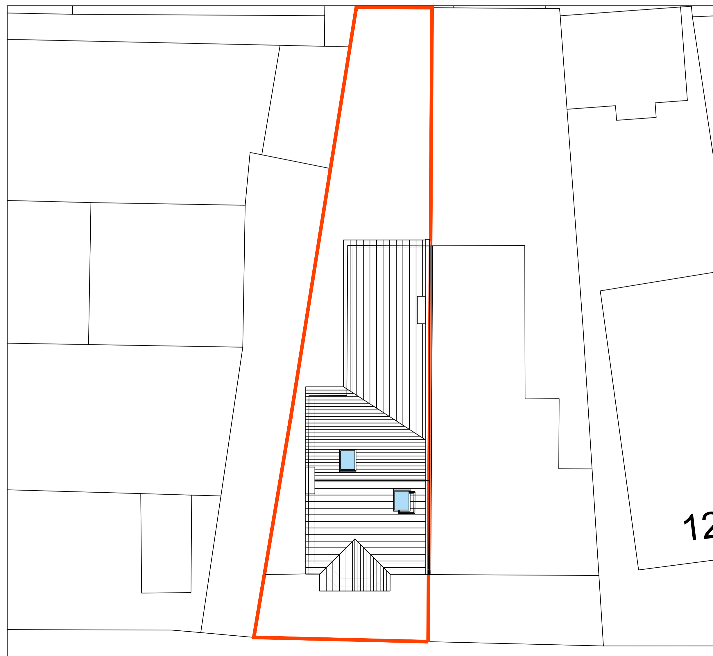
4 EXISTING ROOF PLAN SCALE: 1:100 @ A1