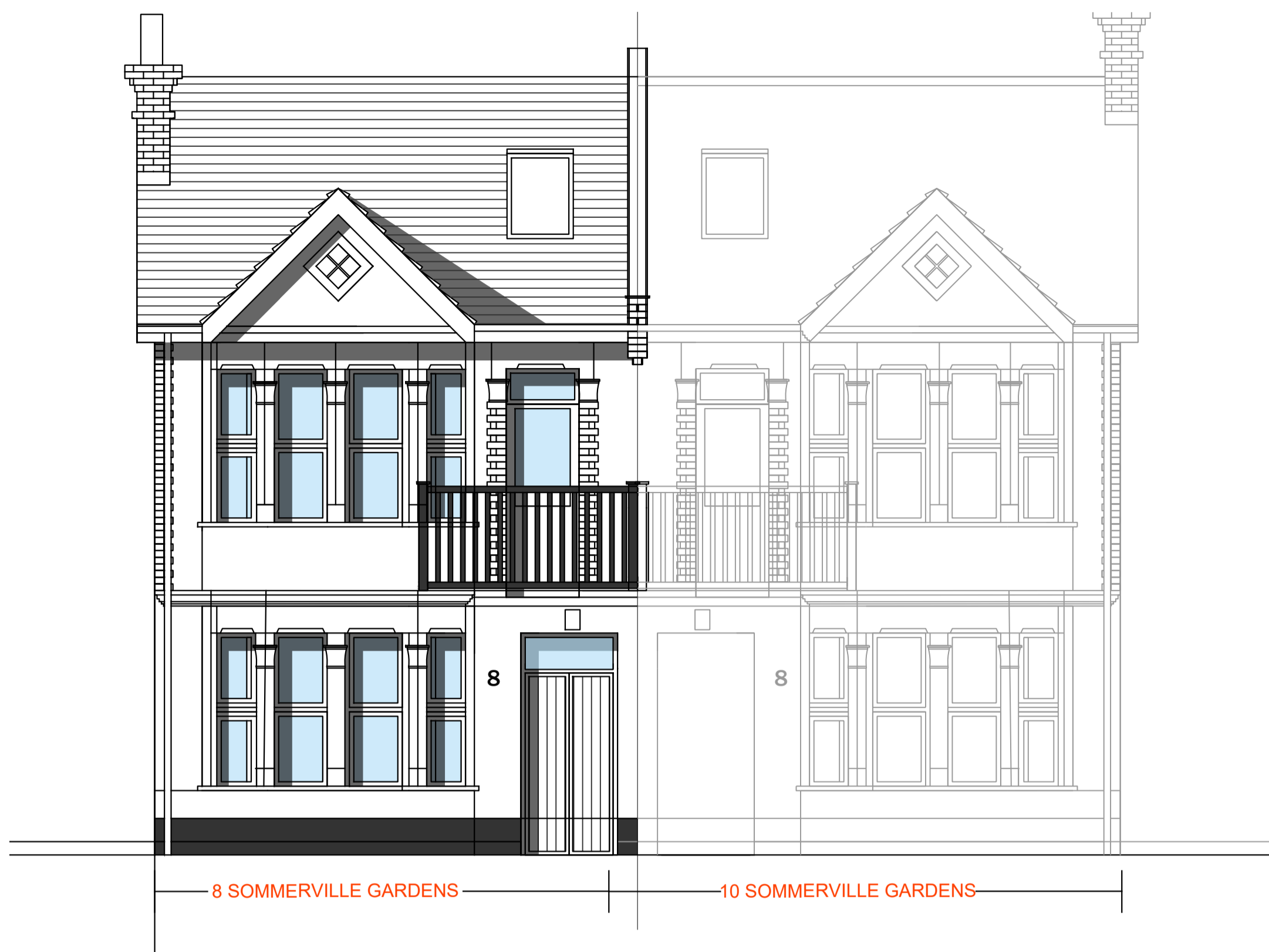
1 EXISTING FRONT ELEVATION A-A SCALE: 1:50 @ A1